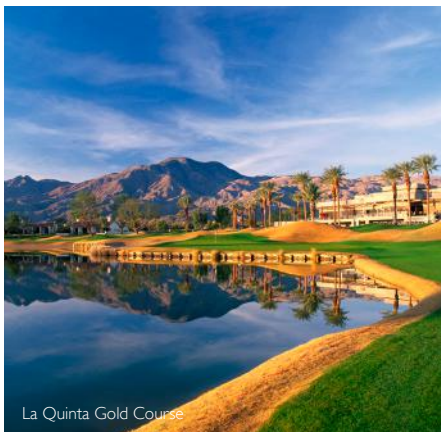
La Quinta Gold Course

Die-hard chocolate fanatics will want the Dark Chocolate Fountain Extraordinaire.