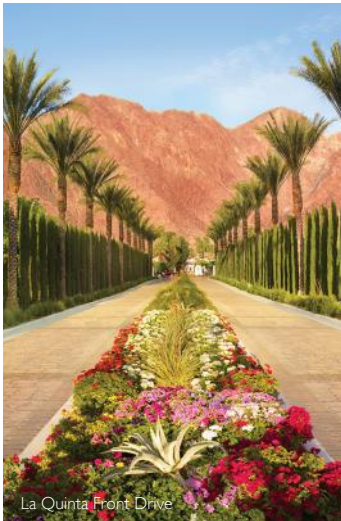
La Quinta Front Drive

An optimal time to partake of Gaetner's cuisine is Desert Willow Uncorked: A Night of Food, Wine and Spirits on May 3. Wine tastings and samplings of fine, high-end spirits are at the ready for pairings.