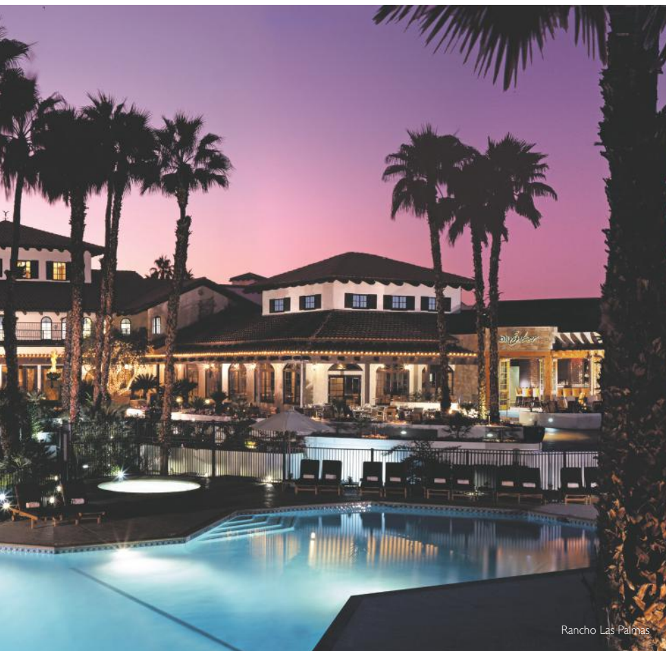
Rancho Las Palmas

Discovery's Full Moon Hike is the ticket. Sunset also gets attention, as the tour departs one hour prior to that spectacular desert event. From here, trekkers explore the Palm Springs foothills, getting an education in the desert's flora, fauna, geography and history. The moderate-level hike (2½ miles round trip with 300-foot elevation gain) wends to a special locale for taking in the moonrise and city lights.