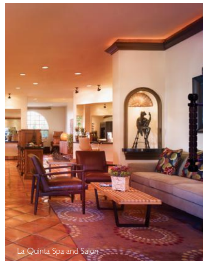
La Quinta Spa and Salon

Still to come: those aforementioned stars that can only be accessed at The Show at Agua Caliente. Some of the best seats in the four-level theater are the 12 luxury box/suites. Ready for that dessert? Numerous packages will satisfy those with a sweet tooth. One that spells pure satisfaction is Stimulation and Libation, which comes with a three-minute chair massage, chocolate truffles, fresh-fruit smoothies and daiquiris.