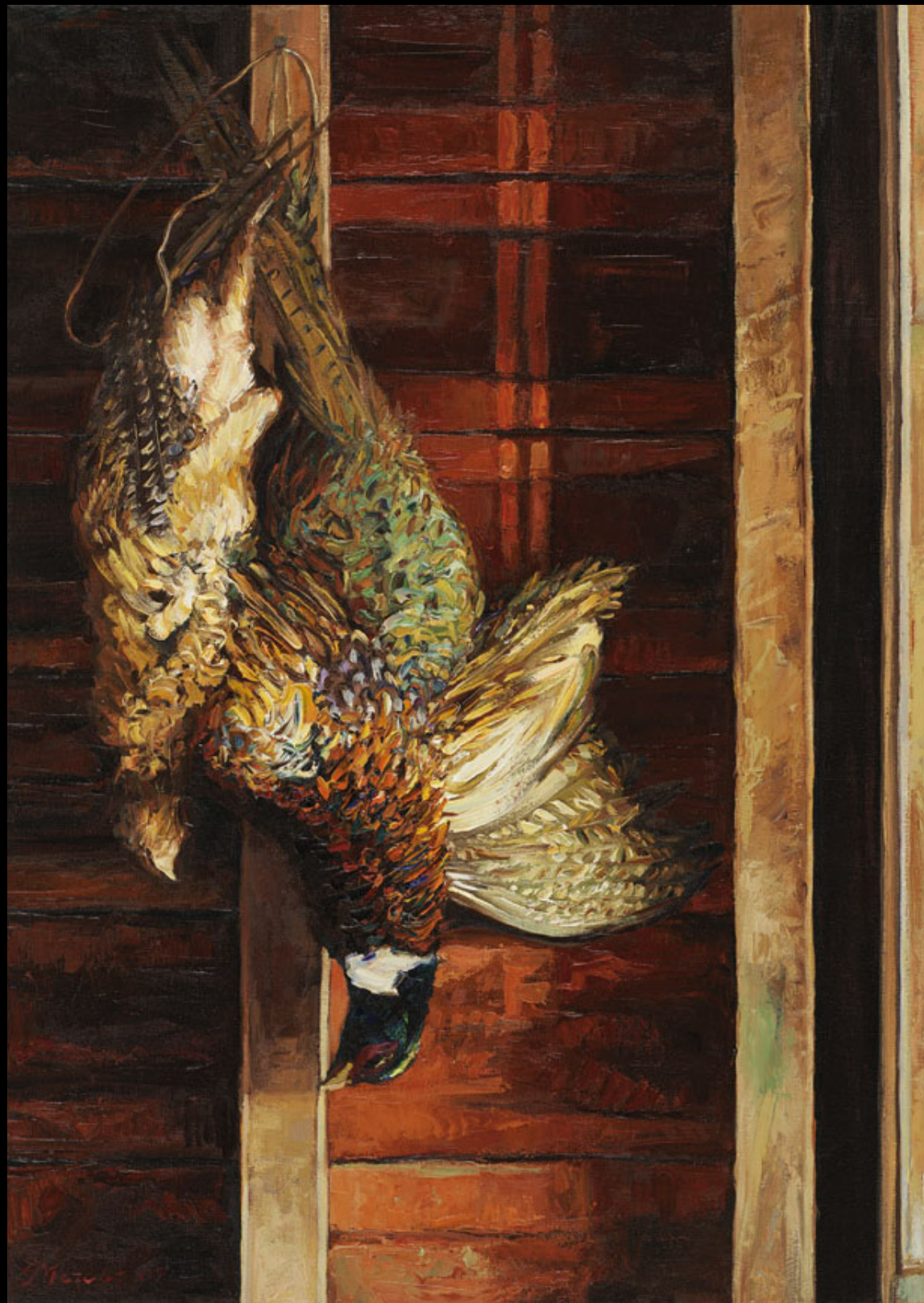
TWO PHEASANTS—Oil On Canvas—18.5" x 26"—2007