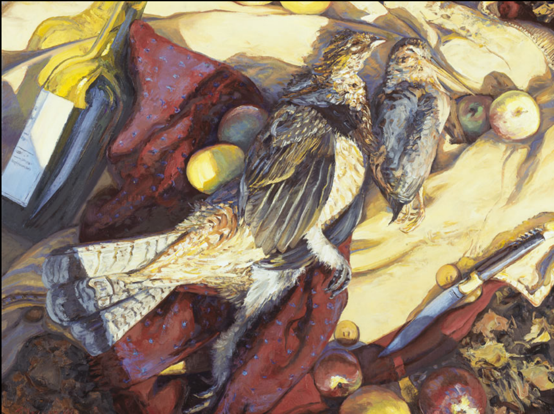
STILL LIFE WITH GAMEBIRDS & CALVADOS—Oil On Canvas—22" x 28"—2010