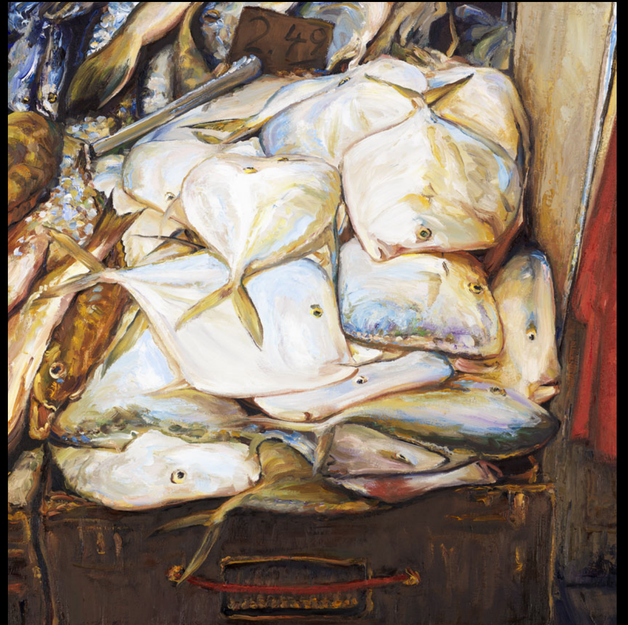
FISH MARKET—Oil On Canvas—18" x 18"—2010