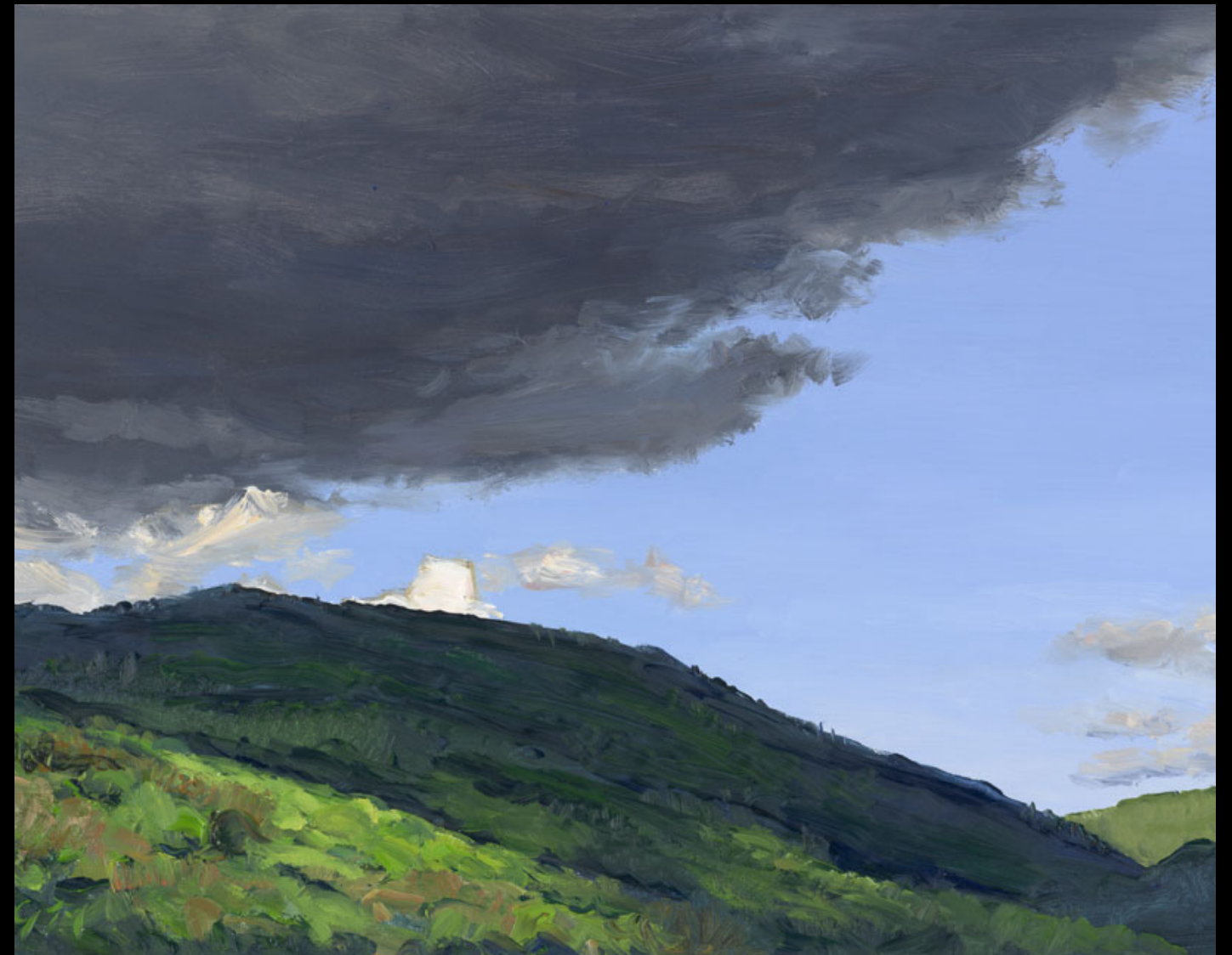
CLEARING STORM, CATSKILLS—Oil On Panel—12" x 16"—2010