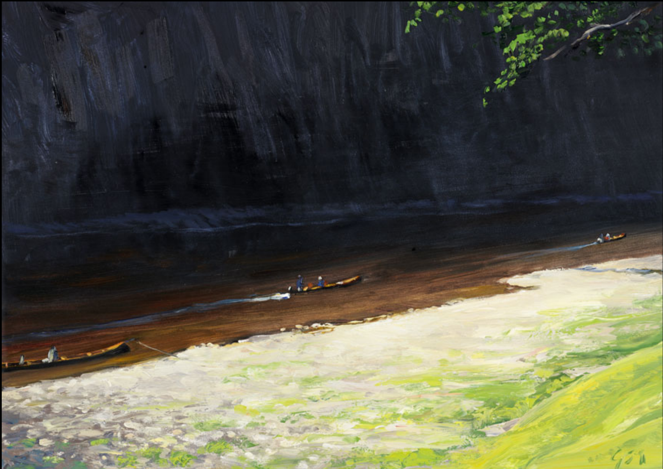
HEADING UP—Oil On Panel—12" x 16"—2010