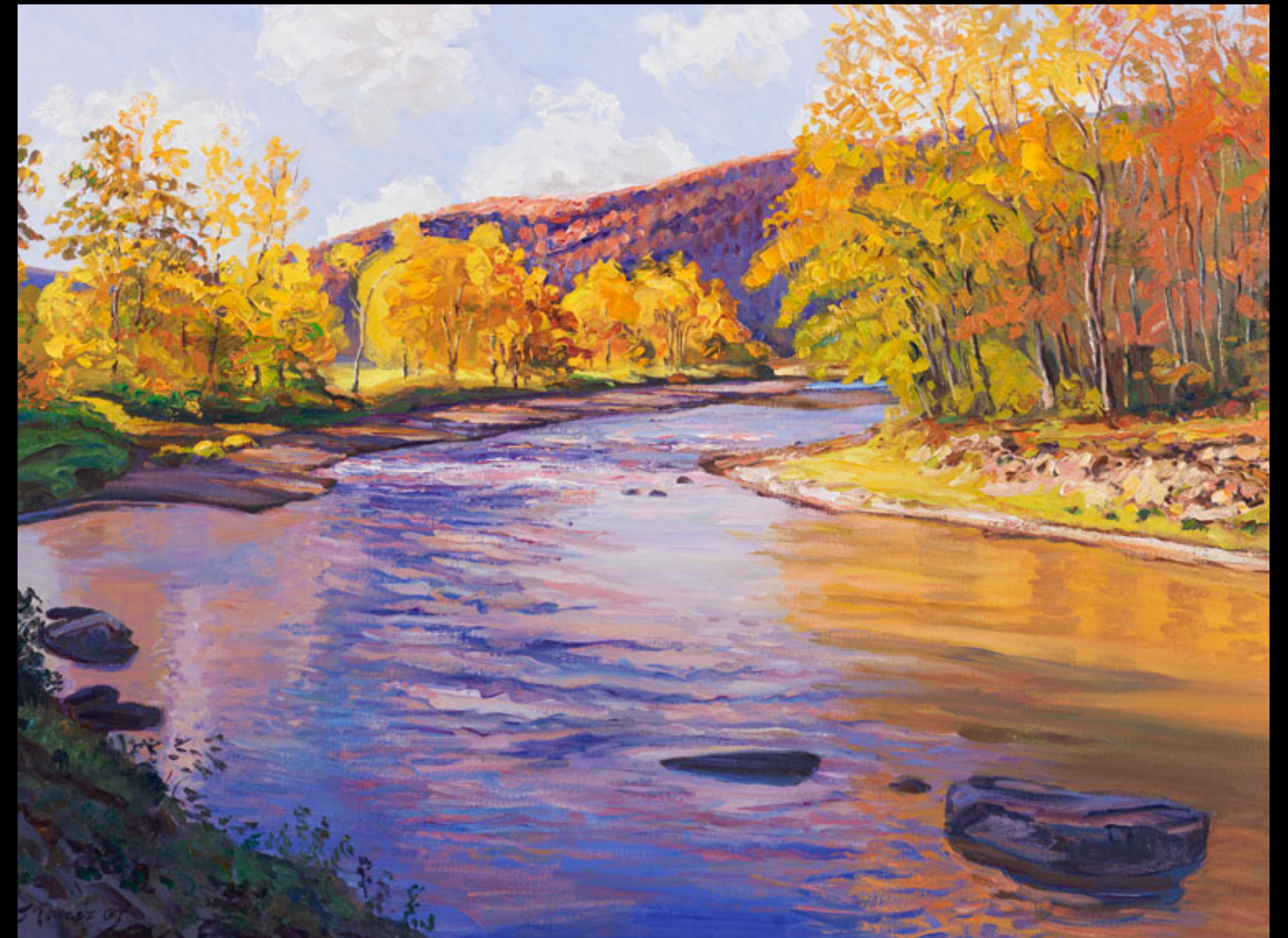
LOWER BEAVERKILL, AUTUMN—Oil On Canvas—22" x 28"—2007

On the canvas surface, Galen paints, but deeper still it's more a life well lived than it is paintings hanging on walls.