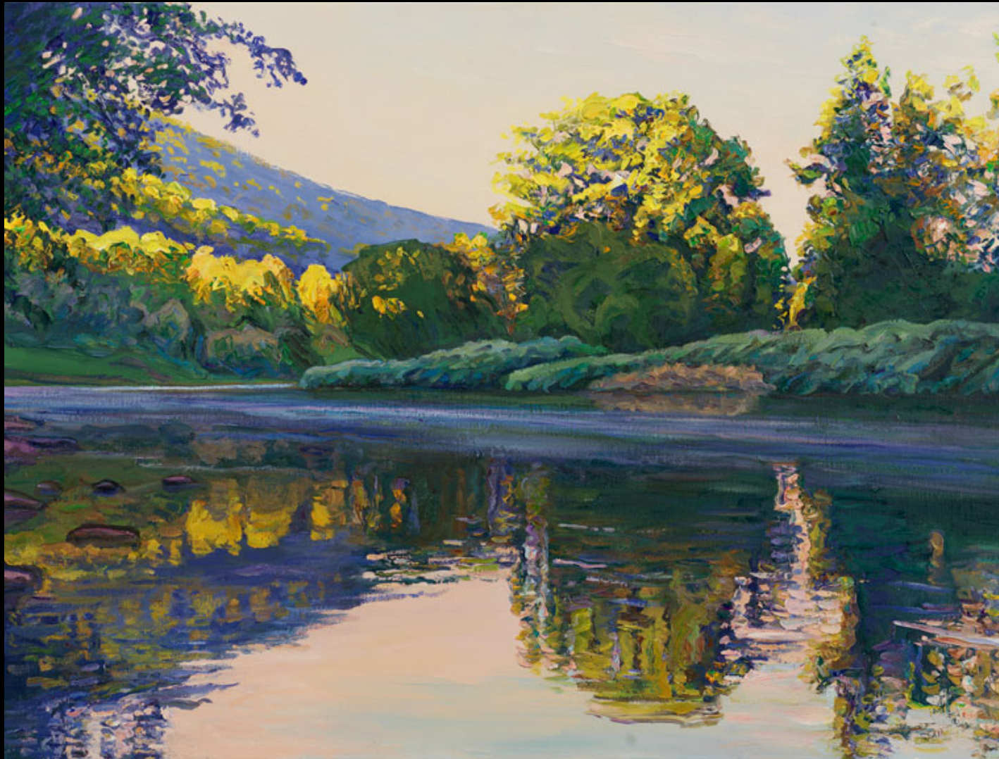
WEST BRANCH, EVENING LIGHT—Oil On Canvas—22" x 28"—2007