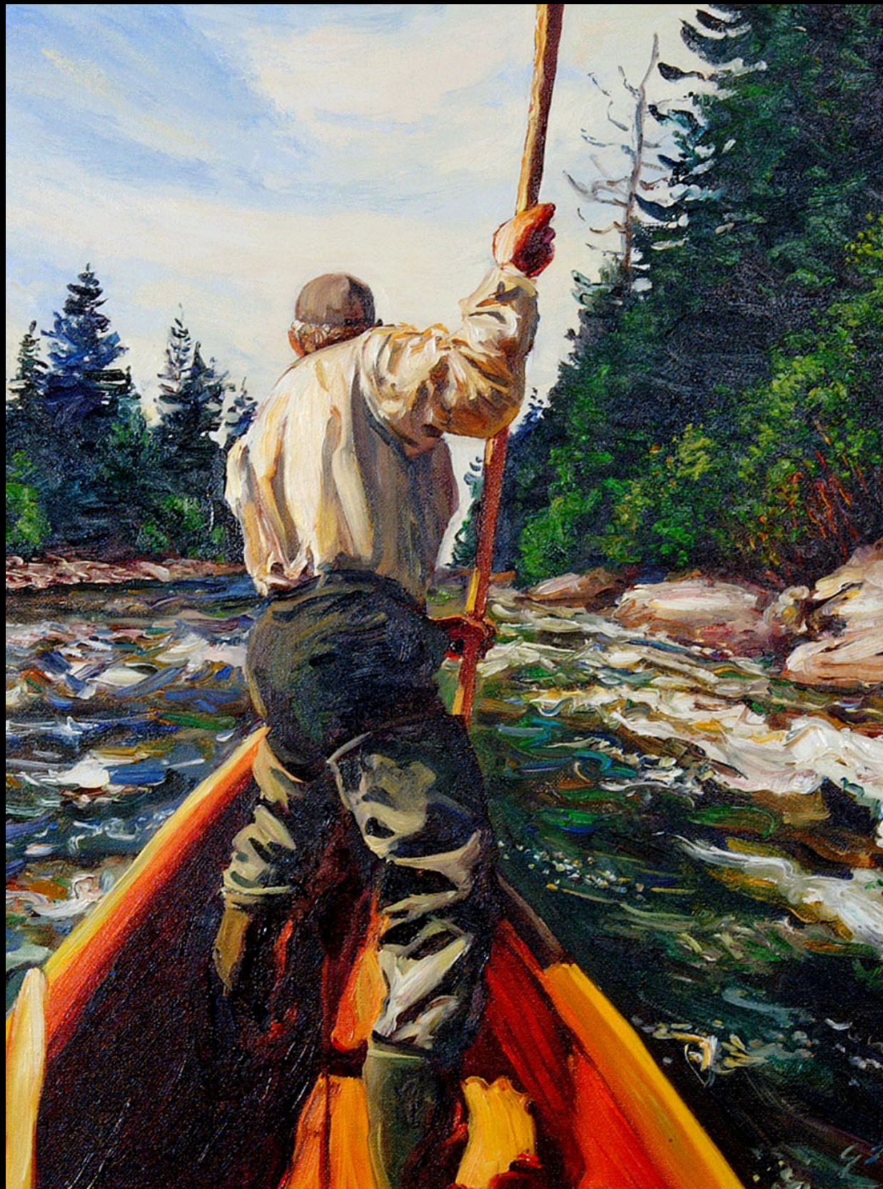
GASPÉ GUIDE—Oil On Canvas—16" x 19"—2003